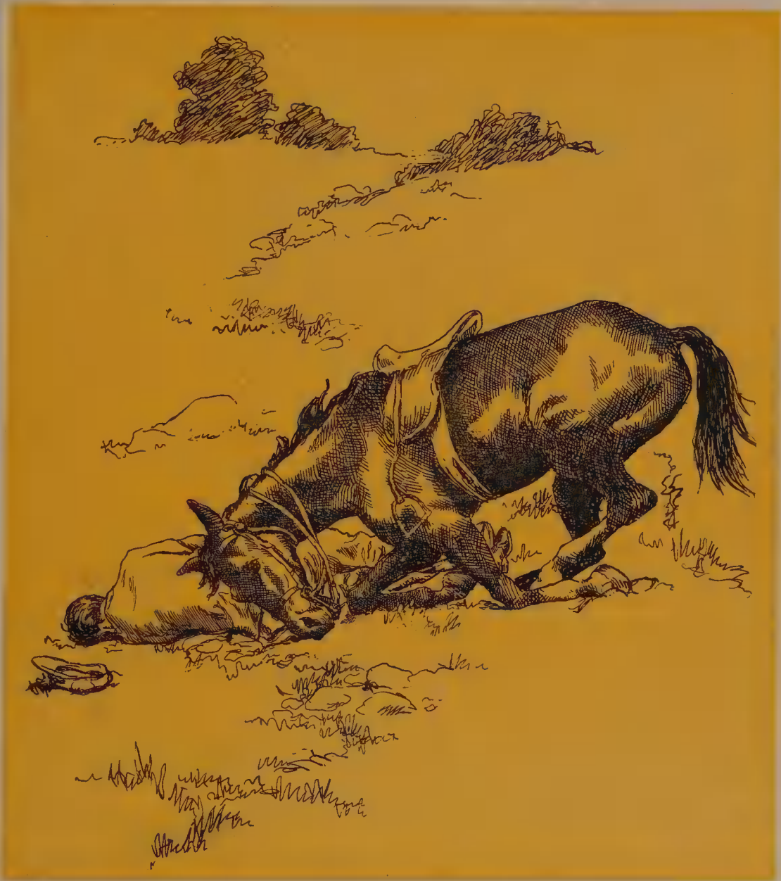
The other lay quite still